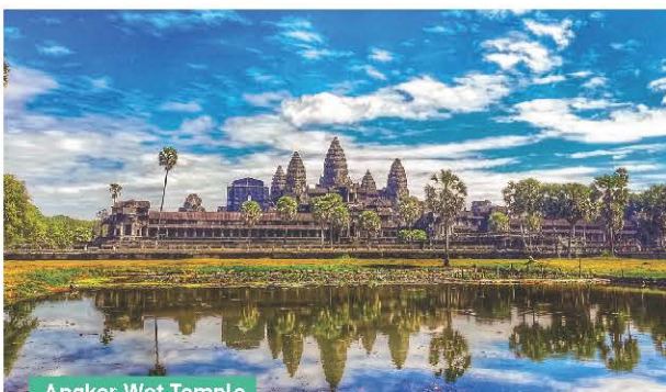
Angkor Wat Temple

The Angkor Wat Temple is the most famous of all Angkorian temples. Back in the 12th century it was built by King Suryavarman II which took an estimated 30 years to build. It was initially dedicated to the Hindu god, Vishnu but was later dedicated to Buddhism and this temple is the only one of the Angkorian temples to remain in religious use throughout the centuries. Angkor Wat became heritage of humanity and was listed as a World Wonder in 1992.