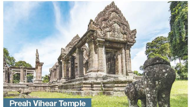
Preah Vihear Temple

This temple was declared as a World Cultural Heritage Site by UNESCO on July 8, 2017 and is an archaeological site in Cambodia located in Kampong Thom Province. The now ruined complex dates back to the Pre-Angkorian Chenla Kingdom from the late 6th century to the 9th century. It was established by King Isanavarman I in the early 7th century as a central royal sanctuary and capital where the site served as an important religious centre for the worship of Shiva as one of the two leading gods of Hinduism.