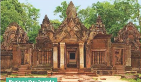
Banteay Srei Temple

Banteay Srei was constructed in the 10th century and its name means 'Citadel of Women'. It is made from red sandstone and many of its elements appear in comparatively miniature form making it unique amongst all other Angkorian temples. The decorative and detailed wall carvings which are still observable today make this temple extremely popular and has led to being widely praised as a 'precious gem' or a 'jewel of Khmer art'.