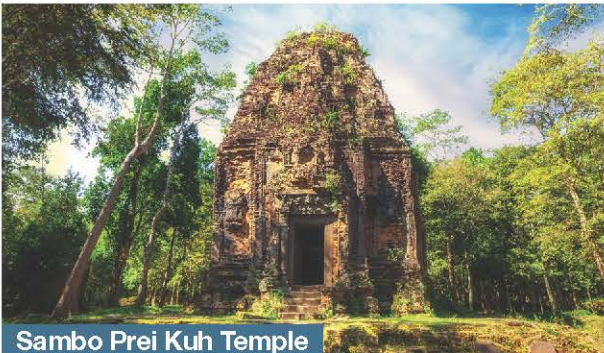
Sambo Prei Kuh Temple

Ta Prohm was built similar in style to Bayon during the late 12th century. It was originally a Mahayana Buddhist monastery and a university. What makes this complex unique is that, unlike most Angkorian Temples, Ta Prohm has been left in the same condition in which it was found. The photogenic and atmospheric combination of trees growing out of the ruins and the jungle surroundings have made it one of Angkor's most popular temples.