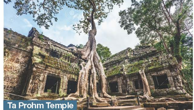
Ta Prohm Temple

Banteay Srei was constructed in the 10th century and its name means 'Citadel of Women'. It is made from red sandstone and many of its elements appear in comparatively miniature form making it unique amongst all other Angkorian temples. The decorative and detailed wall carvings which are still observable today make this temple extremely popular and has led to being widely praised as a 'precious gem' or a 'jewel of Khmer art'.