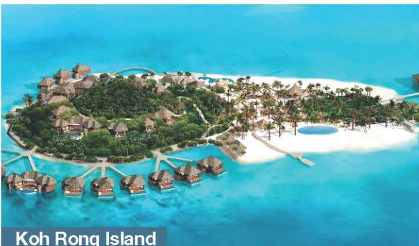
Koh Rong Island

Koh Rong Island is one of the most gorgeous and loveliest islands in the Cambodia Bay which is located 25 km off the coast of Preah Sihanouk province. Its white sand beaches and turquoise water makes this place a dreamy tropical paradise.