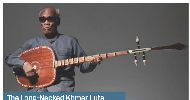
The Long-Necked Khmer Lute

Sambo Prei Kuh Temple–The World Cultural Heritage, Date of Proclamation: July 07,2017.