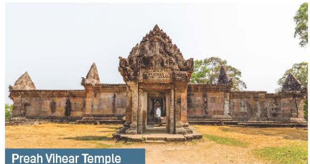
Preah Vihear Temple

Angkor Wat Temple–Heritage of Humanity and World Wonder, Date of Proclamation: December 14 1992.