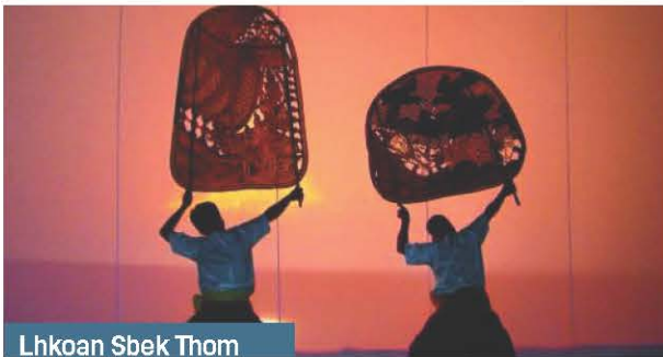
Lkhoan Sbek Thom

Apsara Dance “the Royal Ballet of Cambodia”, a masterpiece of Oral and Intangible Heritage of Humanity, Date of Proclamation: November 2003.