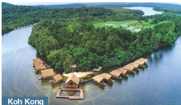
Koh Kong Province