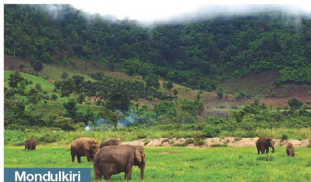
Mondul Kiri Province

Rattanakiri is renowned for its unique natural beauty and wealth of natural resources. The undulating hills and mountains, plateaus, watershed lowlands, clear crater lakes, rivers and beautiful waterfalls form an impressive itinerary of intriguing destinations for eco-tourism.