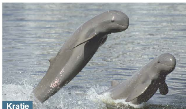
Stung Treng Province

This waterfall is the biggest waterfall along the Mekong river in Cambodia. This amazing waterfall never ceases to mesmerise visitors. The stretch of the mighty Mekong is also a great place to observe the very rare Irrawaddy dolphins.