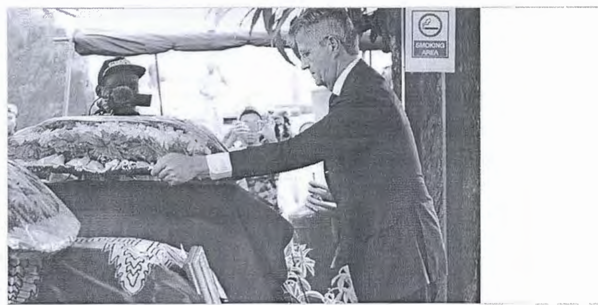
Under-Secretary-General for Peacekeeping Operations Jean-Pierre Lacroix takes part in a ceremony honouring five peacekeepers killed in an attack on their convoy on 8 May 2017 in southeast Central African Republic (CAR).

12 May 2017 – The United Nations Multidimensional Integrated Stabilization Mission in the Central African Republic (MINUSCA) held a memorial ceremony today in honour of five peacekeepers who lost their lives after their convoy was attacked in the south-eastern part of the country earlier this week.